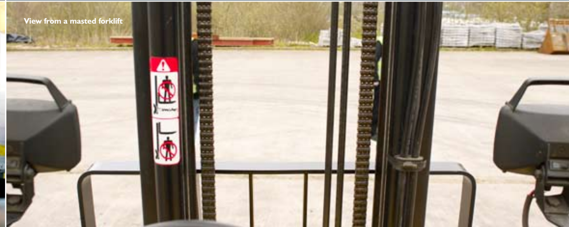
View from a masted forklift