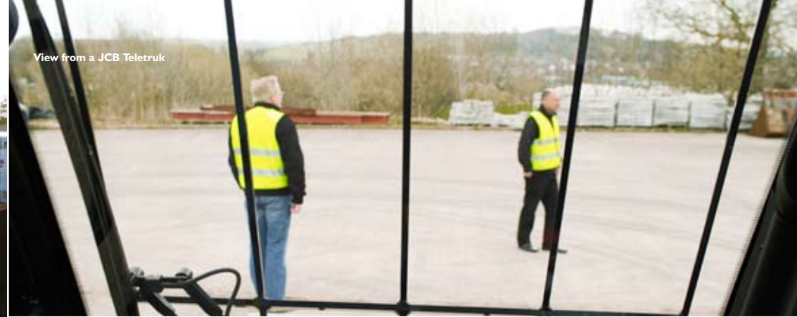
View from a JCB Teletruk