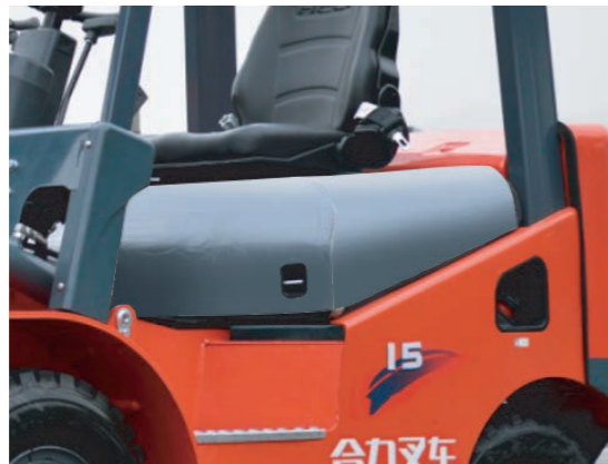
新式机罩 The new hood