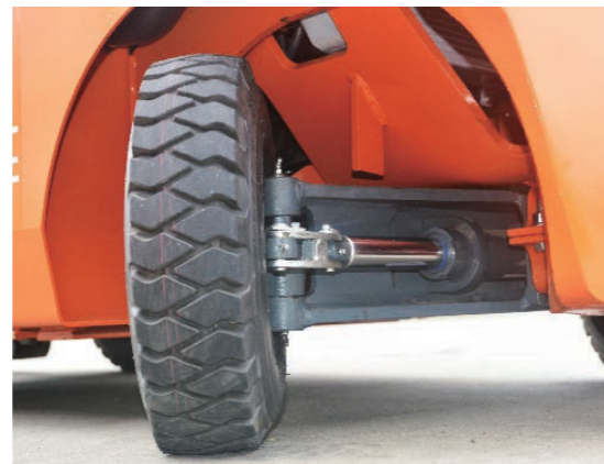
可靠的转向桥 Reliable steering bridge