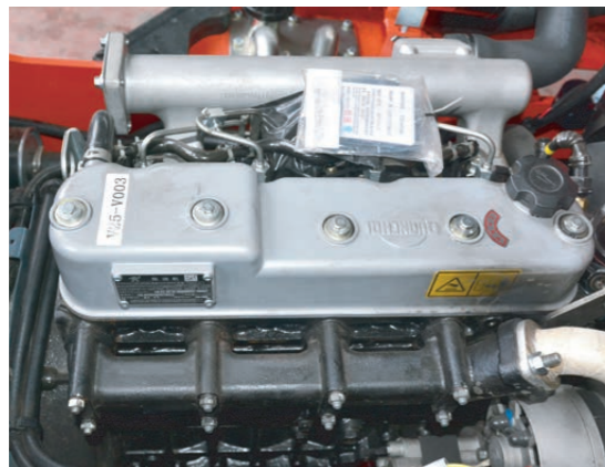
国四排放动力 Power of emission