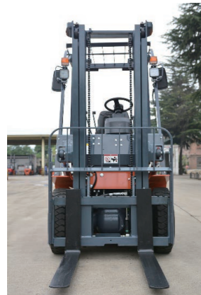
宽视野门架 Wide view mast