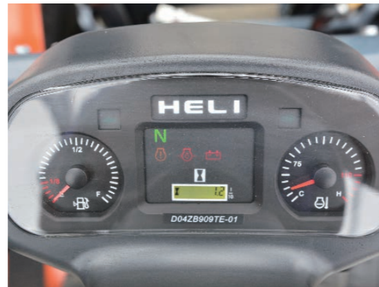
液晶仪表 LCD meters